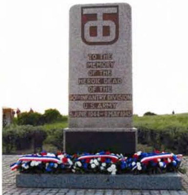
T/O Monument - Utah Beach - 3 wreaths laid in Memory on 70th Anniversary